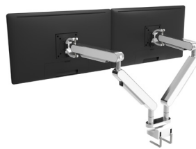
chrome effect paint finish